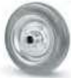
112 / ANTIMACCHIA NO-MARKING