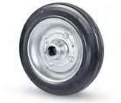
112 / GOMMA PIENA 80 Shore A RUBBER TYRE 80 Shore A