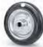
112AO / ANTIOLIO OIL-PROOF